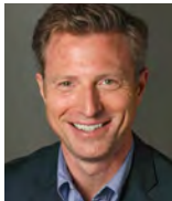
Patrick Nolan Penguin, USA