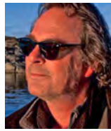
Halfdan Freihow Font Forlag, Norway