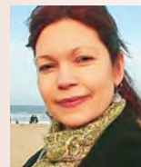
Bénédicte Lombardo Editions du Seuil, France